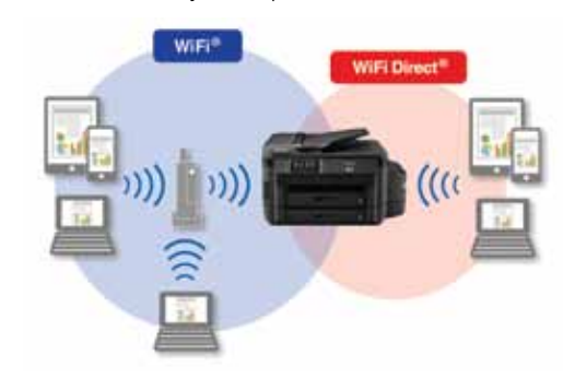
*WiFi and WiFi Direct cannot be used simultaneously.

Equipped with Ethernet, WiFi, and WiFi Direct*, the L1455 is perfect for office environments. WiFi Direct acts as an access point, allowing up to four devices to connect directly to the printer at a time without a router.